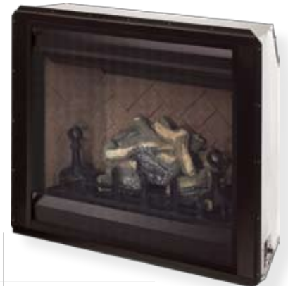
KCC42EPH is our 42" clean-faced propane model with textured herringbone brick liner and electronic ignition.