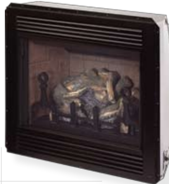
KC36N features natural gas and stacked design textured and colored brick-lined interior.

36" AND 42" DIRECT VENT GAS FIREPLACES KC36 and KC42 Model Series