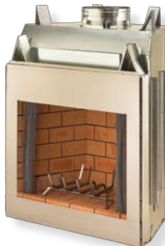
Masonry Portofinos are available in 36", 42" and 50" wide openings with Full 30" clear opening height.