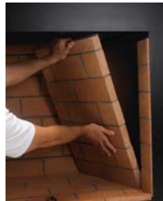
Mosaic Masonry™ made simple. All new pre-engineered firebrick system features steel reinforced, factory-built and grouted masonry walls that easily slip into place and securely fasten to the steel fireplace chassis.